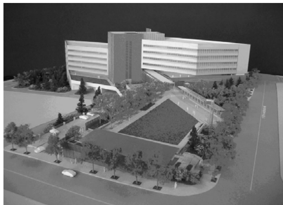
Site: Model of Bellevue's new City Hall